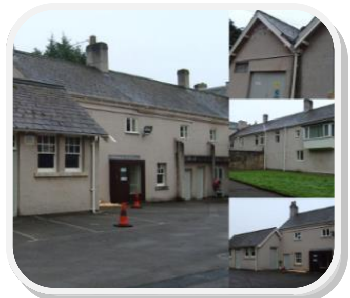
Toulston— timberwork and framework repaired and painted