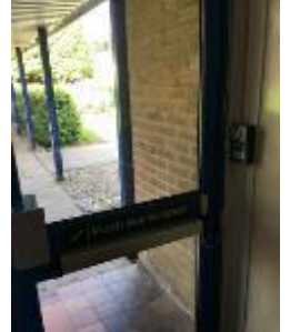
New door security

During the summer there have been many improvements to our school site, including those below and the addition of door locks to make our school more secure: