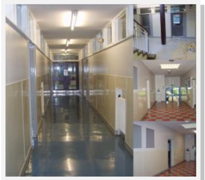
Languages and History corridors refurbished and painted Music corridor fully redecorated