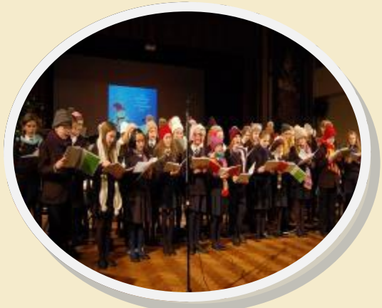
Wednesday 13 December, 2017 at 7pm —Christmas Concert in the Main Hall