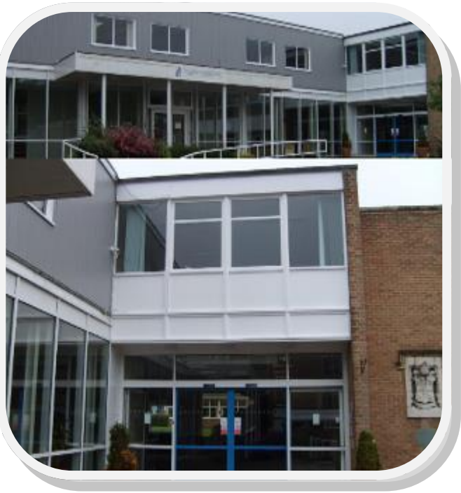
Entrance to school repainted