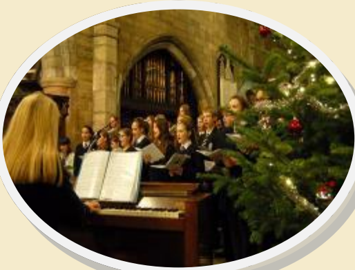
Thursday 7 December , 2017 at 7 pm — Community Carol Service, St Mary's Church

Please come and join us throughout the year for a variety of concerts, productions and performances and watch our talented students in action!