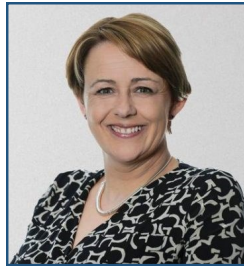
Baroness Tanni Grey-Thompson

This year St Aidan's School in Harrogate for Teaching Staff and King James's School Knaresborough for Support Staff were the hosts. The keynote speaker was Baroness Tanni Grey-Thompson who is one of Britain's most successful Paralympic athletes. The focus of the speech was to explore the day's theme 'Aim High' in which she discussed the challenges she faced as a young girl and her determination to break through the barriers and low expectations that society had for her. She also discussed what personal success really means and reflected on the transition through various stages of her career, from sport, to politics and as a campaigner for improved access to physical activity, trying to mobilise the most physically inactive generation of young people.