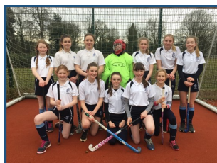
TGS U13 Hockey Team