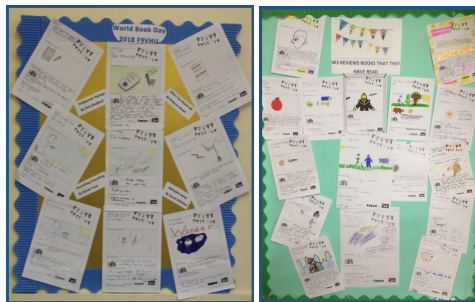
F9 and W3 share their Book Reviews