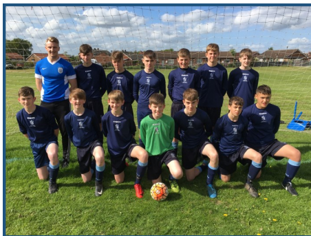
Y9 City Cup Winners

The squad won the League this year and were unbeaten throughout. They also won the City Cup. The Cup Final was against Barlby High School and was played on Thursday 10th of May. The match ended 2-2 and so 15 minutes of extra time were played in which neither team managed to score so it had to be settled in a penalty shootout. TGS won 7-6 on penalties after scoring all 7.