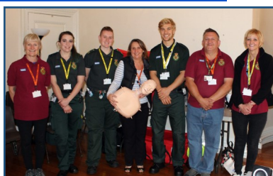
Thank you to the staff and Volunteers

If you would like to find out more about the charity that supports the project the link is https://www.yascharity.org.uk/