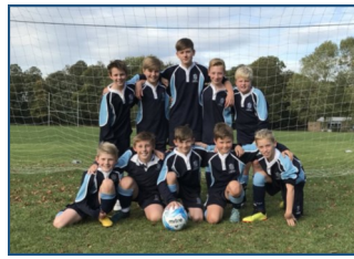
Year 7 Football Team