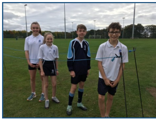
Year 8 Inter House Cross Country