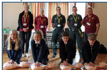
Students learning the Life Saving skills of CPR