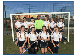
Year 10 Hockey Team