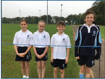
Year 7 Inter-House Cross Country Winners

House group winners this year were – Year 7 Dawson, Year 8 Wharfe and Year 9 Oglethorpe.