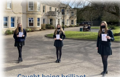
Caught being brilliant

In the next academic year we are committed to increasing our awards and matching our students' efforts and good behaviour for learning with recognition.