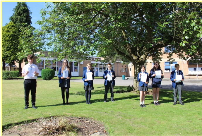
Students who have received all 4 lapel badges

Throughout the year we have awarded 186,000 positives. This shows the students' high standards and staff's awareness of their efforts and behaviour. As students have reached their values target, they have been awarded lapel badges for this year and many have now received all four badges.