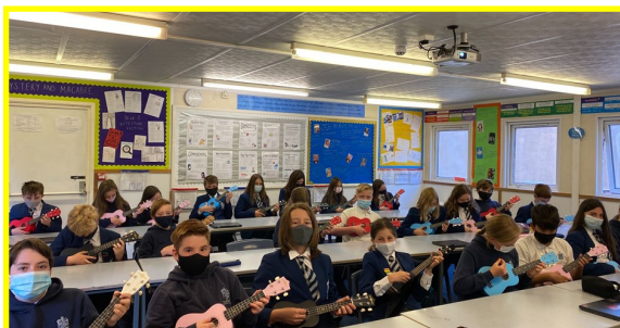
Year 7 students class lesson

Year 7 students have been learning to play the ukulele this half term with the music department's new bright and cheerful class sets of instruments. So far they have learned to