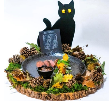
EYES TO GUIDE YOU HOME

The theme for this years competition was 'British Innovation' which was really challenging and exciting, trying to tie the inventions in with the food/ props etc.